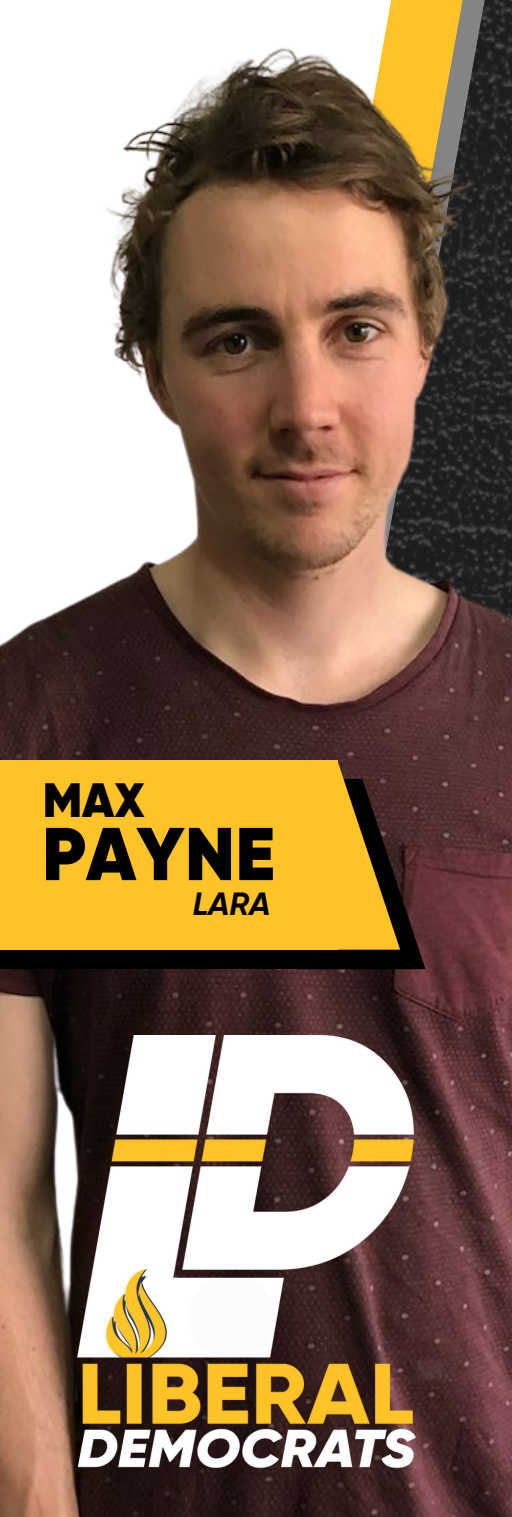
MAX PAYNE LARA